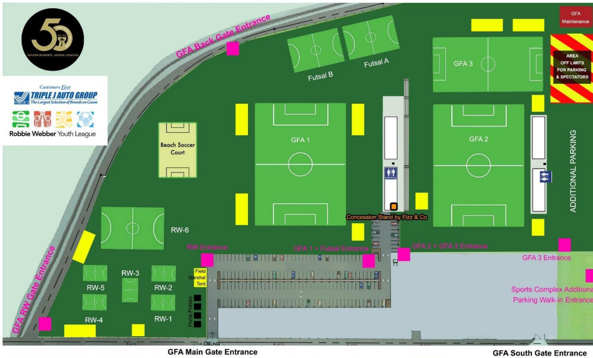
Triple J Auto Group Robbie Webber Youth League Facility Map

*Vehicle entry only allowed at GFA Main Gate Entrance and GFA South Gate Entrance. Entrances denoted with a pink box are for pedestrians only. All youth athletes must be accompanied by an adult. The designated drop off area is between GFA 1 + Futsal Entrance and GFA 2 + GFA 3 Entrance only. Yellow boxes denote spaces where pop up tents are allowed.