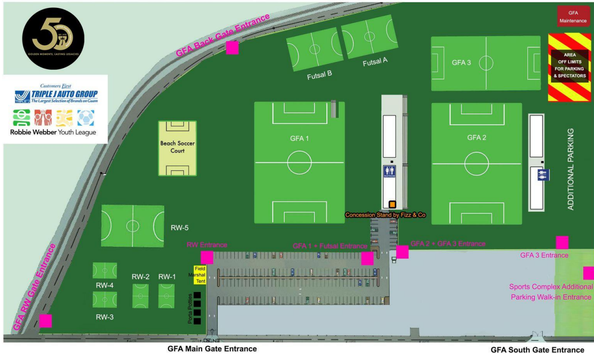
Triple J Auto Group Robbie Webber Youth League Facility Map

*Vehicle entry only allowed at GFA Main Gate Entrance and GFA South Gate Entrance. Entrances denoted with a pink box are for pedestrians only. All youth athletes must be accompanied by an adult. The designated drop off area is between GFA 1 + Futsal Entrance and GFA 2 + GFA 3 Entrance only.