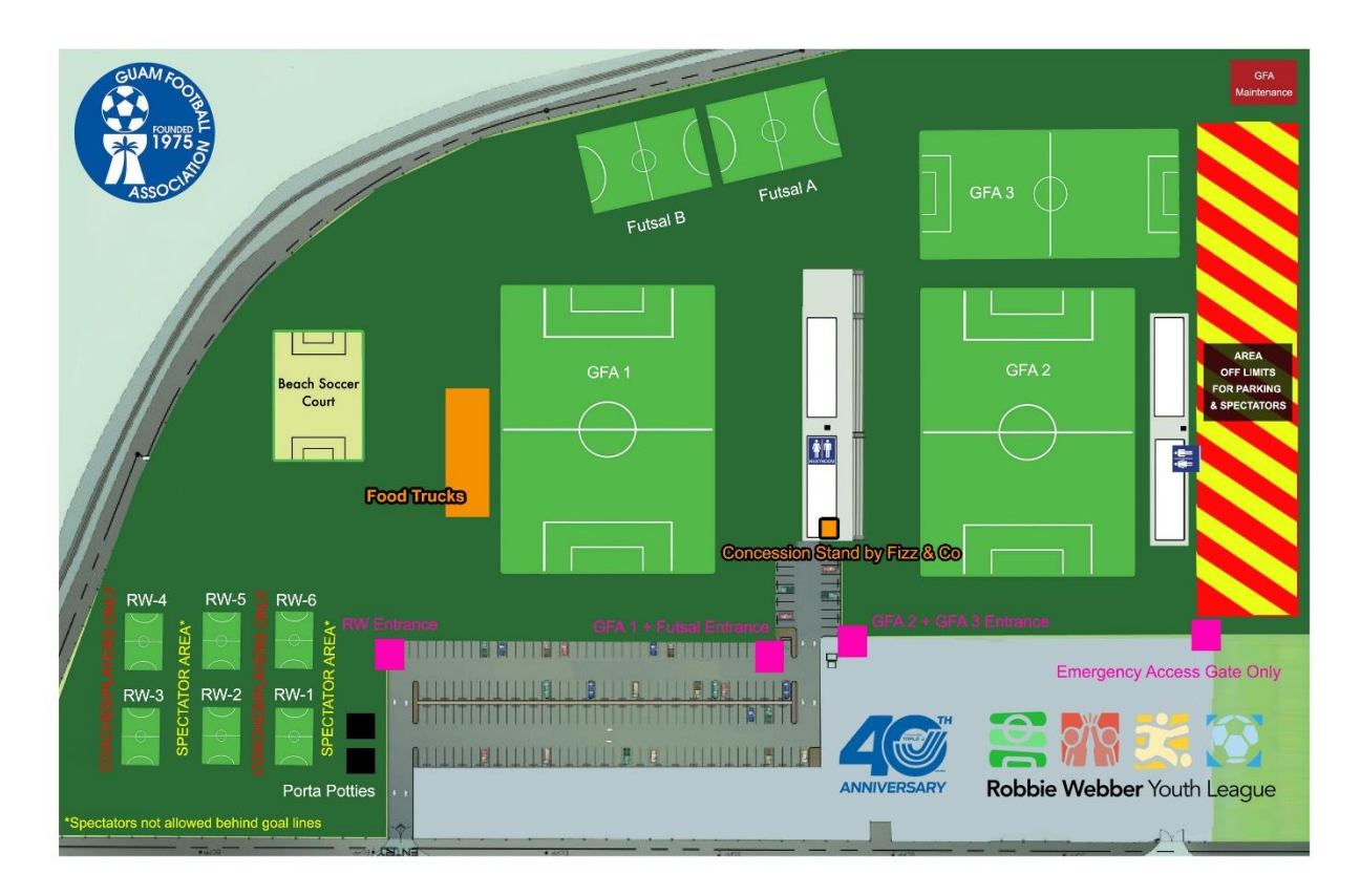
Triple J Auto Group Robbie Webber Youth League Facility Map Fall 2024