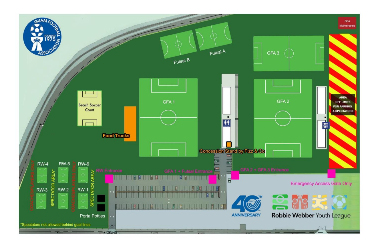
Triple J Auto Group Robbie Webber Youth League Facility Map Fall 2024