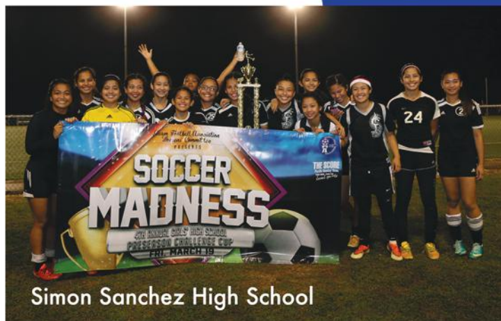
Simon Sanchez High School