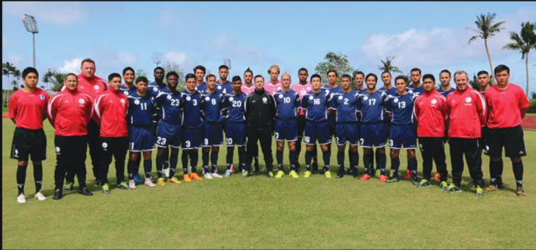
Men's National Team